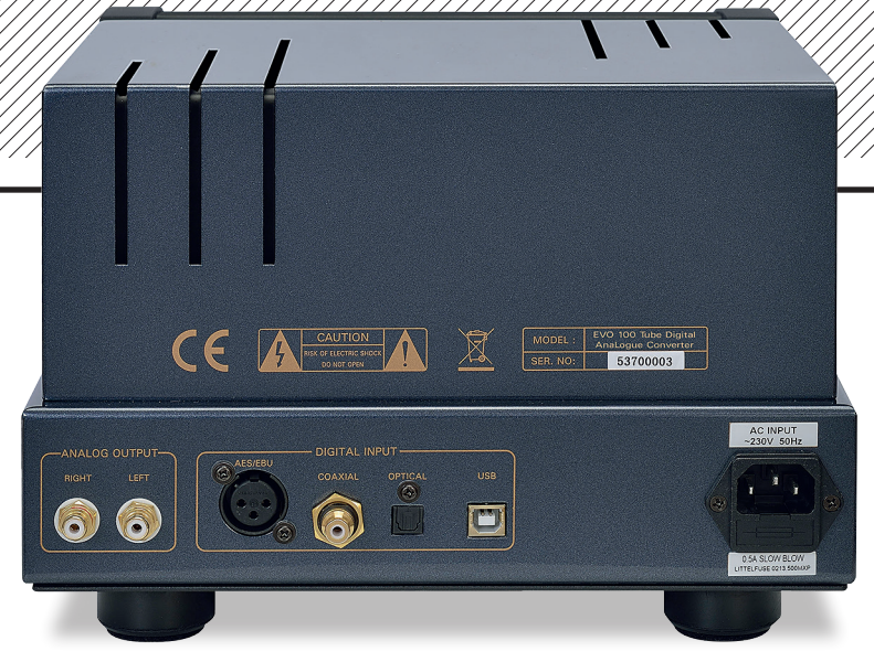
ABOVE: Simplicity itself – four standard digital inputs are fitted including AES/ EBU (XLR), S/PDIF (on RCA and optical) and USB-B for computer connection. Fixed, transformer-coupled analogue outputs are on single-ended (RCA) connections only

had a fatness that I like to think is an approximation of front-to-back depth. Whatever the case, the sensation was of hearing into the music, something not normally attributed to pop singles. The shocker was her later work on CD2.